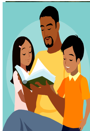
Read to your children each day.

recognition game is to look for specific letters in advertising signs as you drive about town. If doesn't take long for children to "read" Target or Von's!